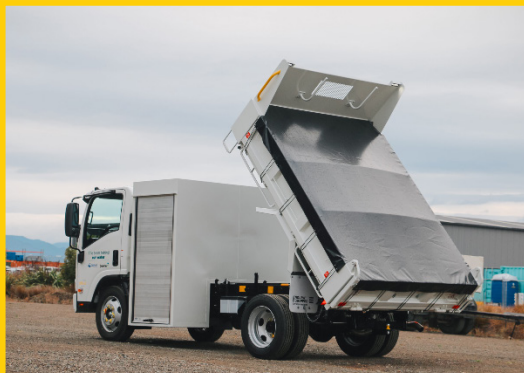
Toolbox Tipper Trucks