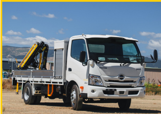
Service & Support Trucks